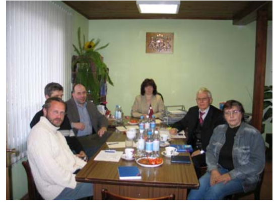
Above left & middle: ASPIRE kick off meeting in Alūksne